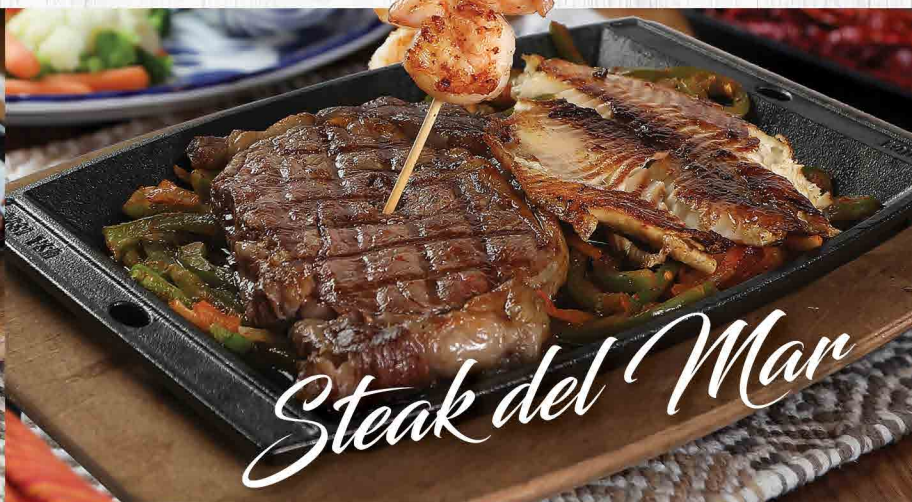
Steak del Mar