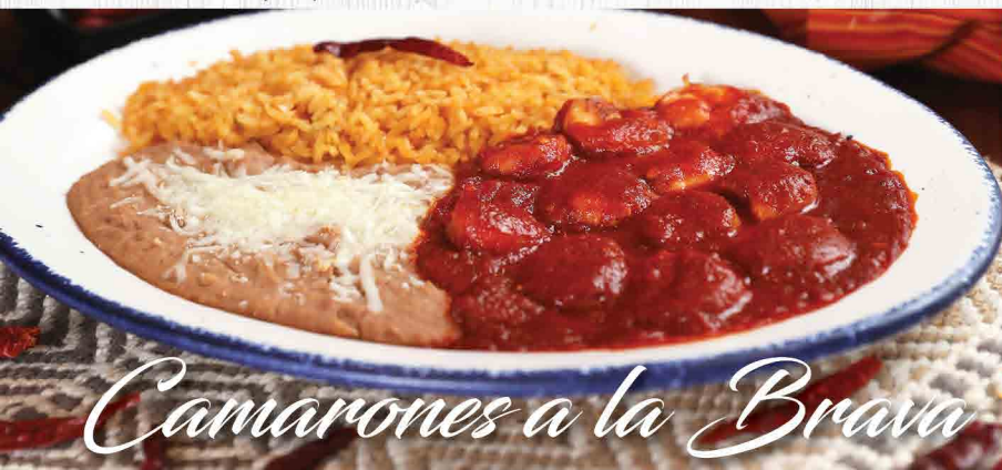
Camarones a la Brava