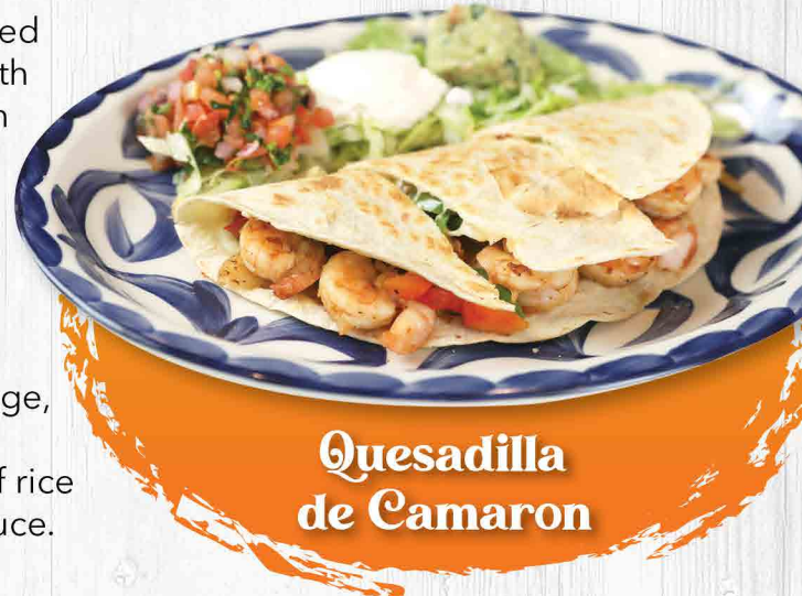
Quesadilla de Camaron

Coctel de Camarones Delicious boiled shrimp mixed with ketchup, our specialty sauce mix, pico de gallo, mild sauce and avocado. 16.99