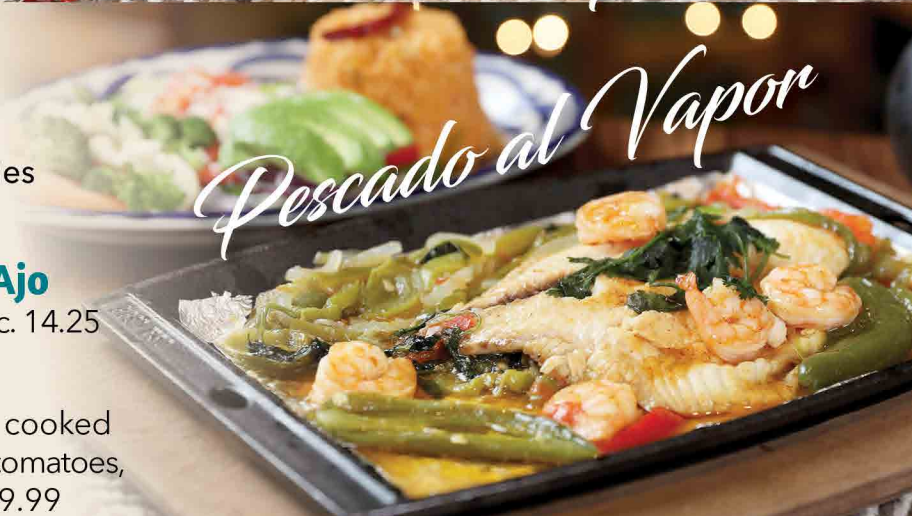
Pescado al Vapor

Pescado al Vapor Steamed fish and shrimp cooked with onions, bell peppers, tomatoes, cilantro and jalapeños. 19.99